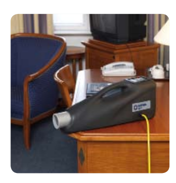
The control panel features timer settings and power level control

The compact design and built-in carrying handle make it easy to move from area to area